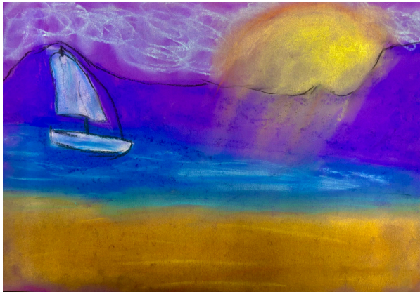
Sailboat by Hunter L.

Congratulations to the following students for having their artwork accepted in the Mainsail art show at Vinoy Park!